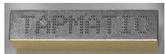
Point to point programming for creating characters with defined dot position or 2D Data Matrix codes.